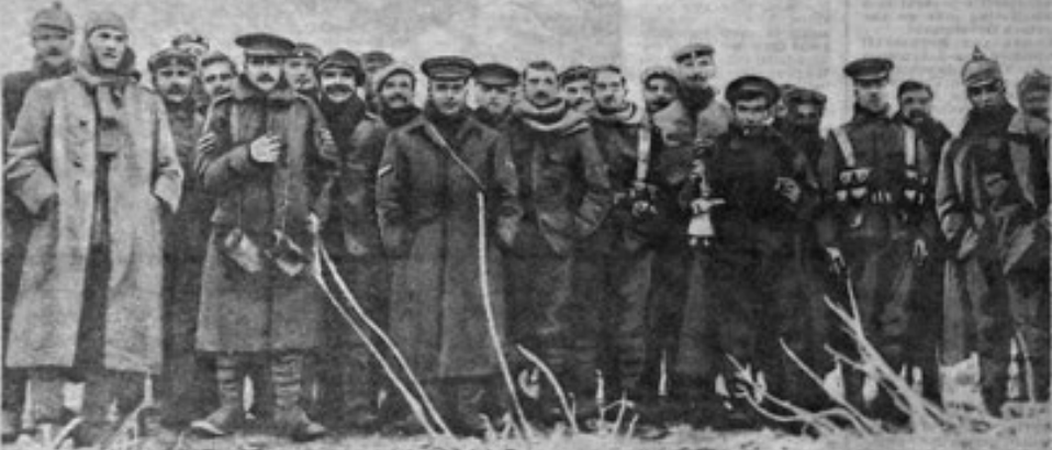
The guns fall silent: British and German troops leave their trenches for a temporary truce on Christmas Day, exchanging gifts of tobacco and chocolate

Over Christmas, some men were greatly struck by the antics of a big German in the trench opposite to them. He