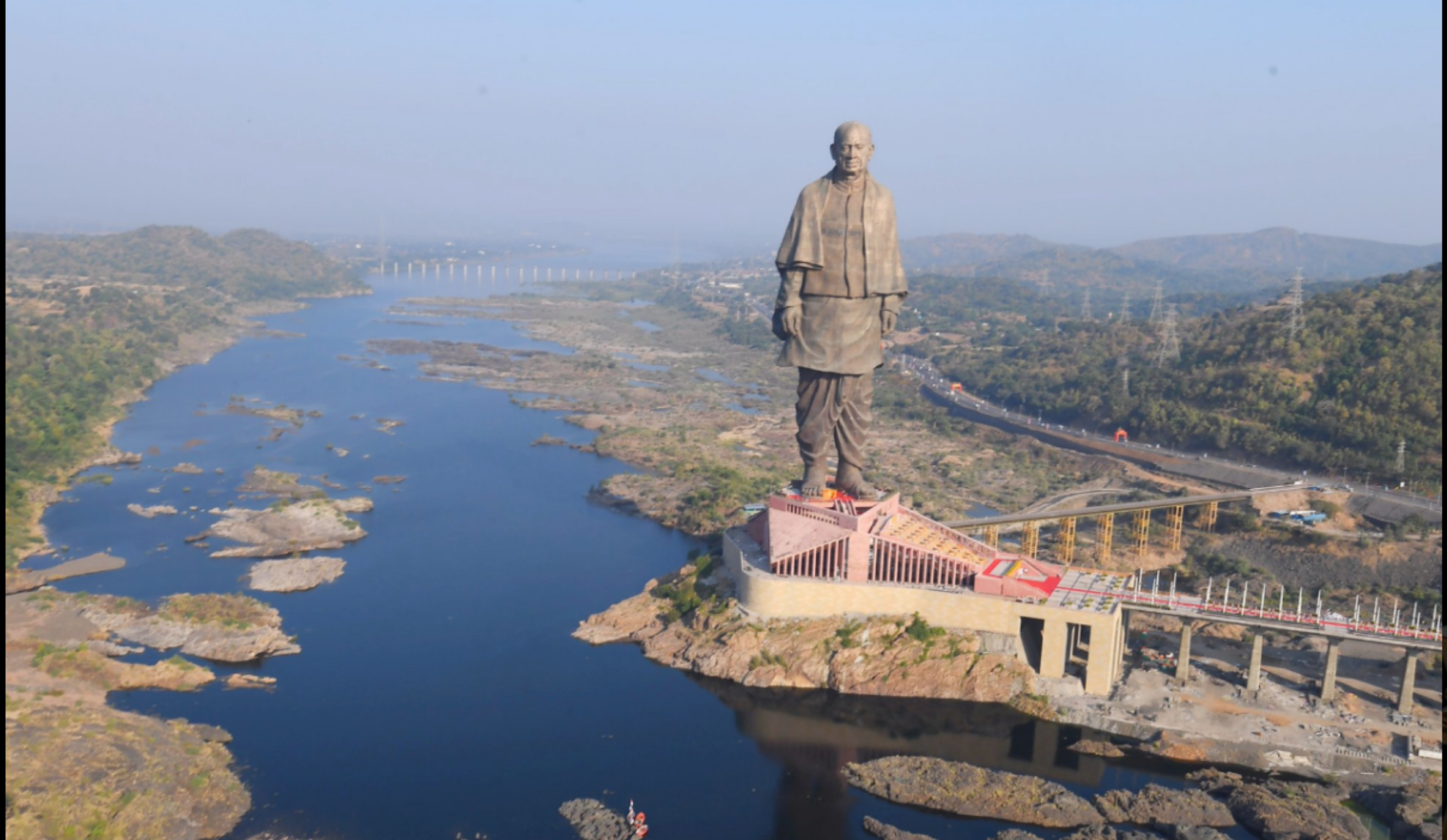
Statue of Unity, India, 597 feet (2x Statue of Liberty)