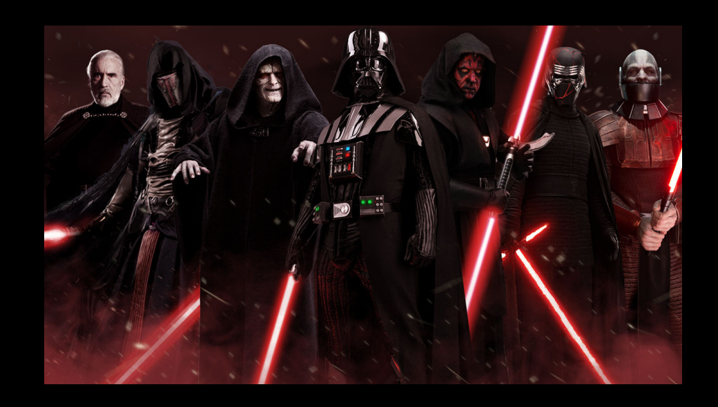
John 1:5 The light shines in the darkness, and the darkness has not overcome it.