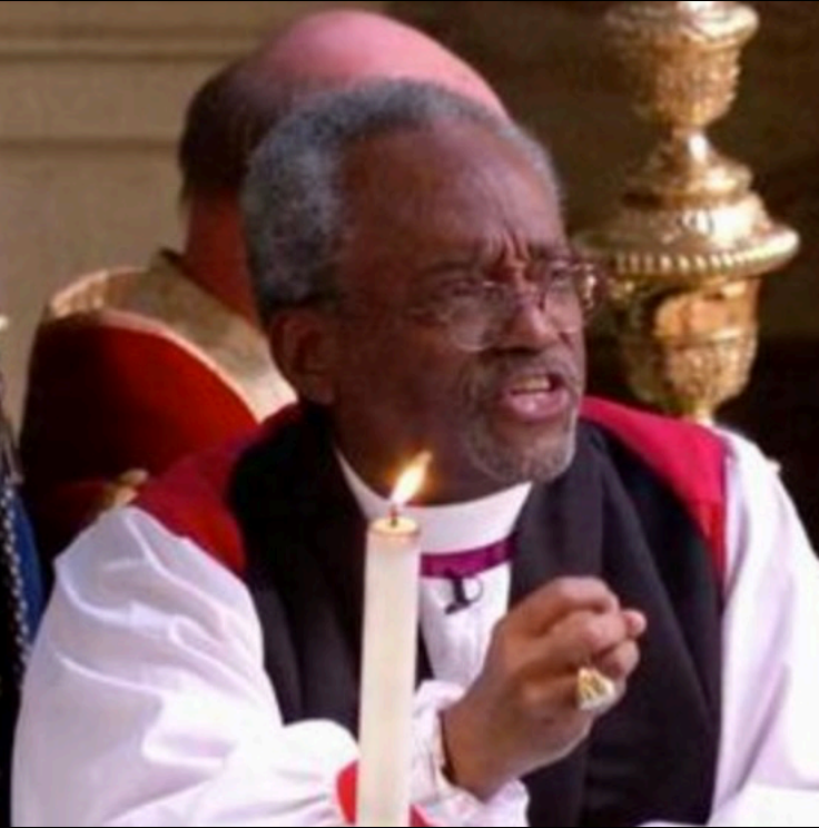
Most Reverend Michael Curry

“Love can be sacrificial, and in so doing, becomes redemptive. And that way of unselfish sacrificial redemptive love, changes lives and it can change this world.”