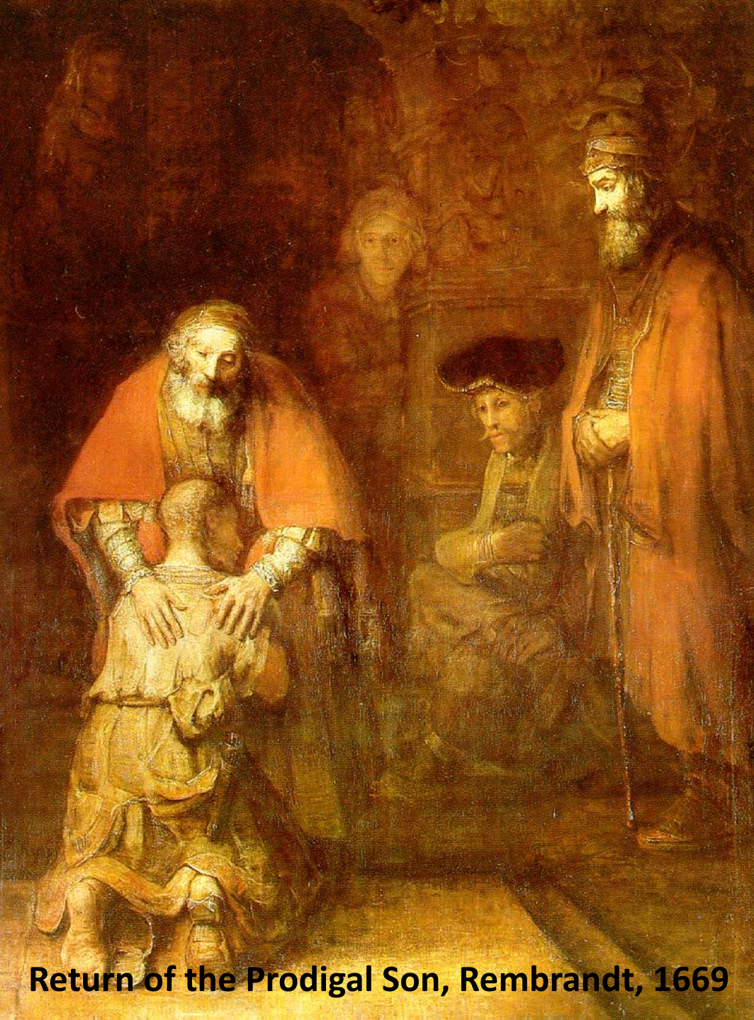
Return of the Prodigal Son, Rembrandt, 1669

“I’m am no longer worthy to be called your son.”