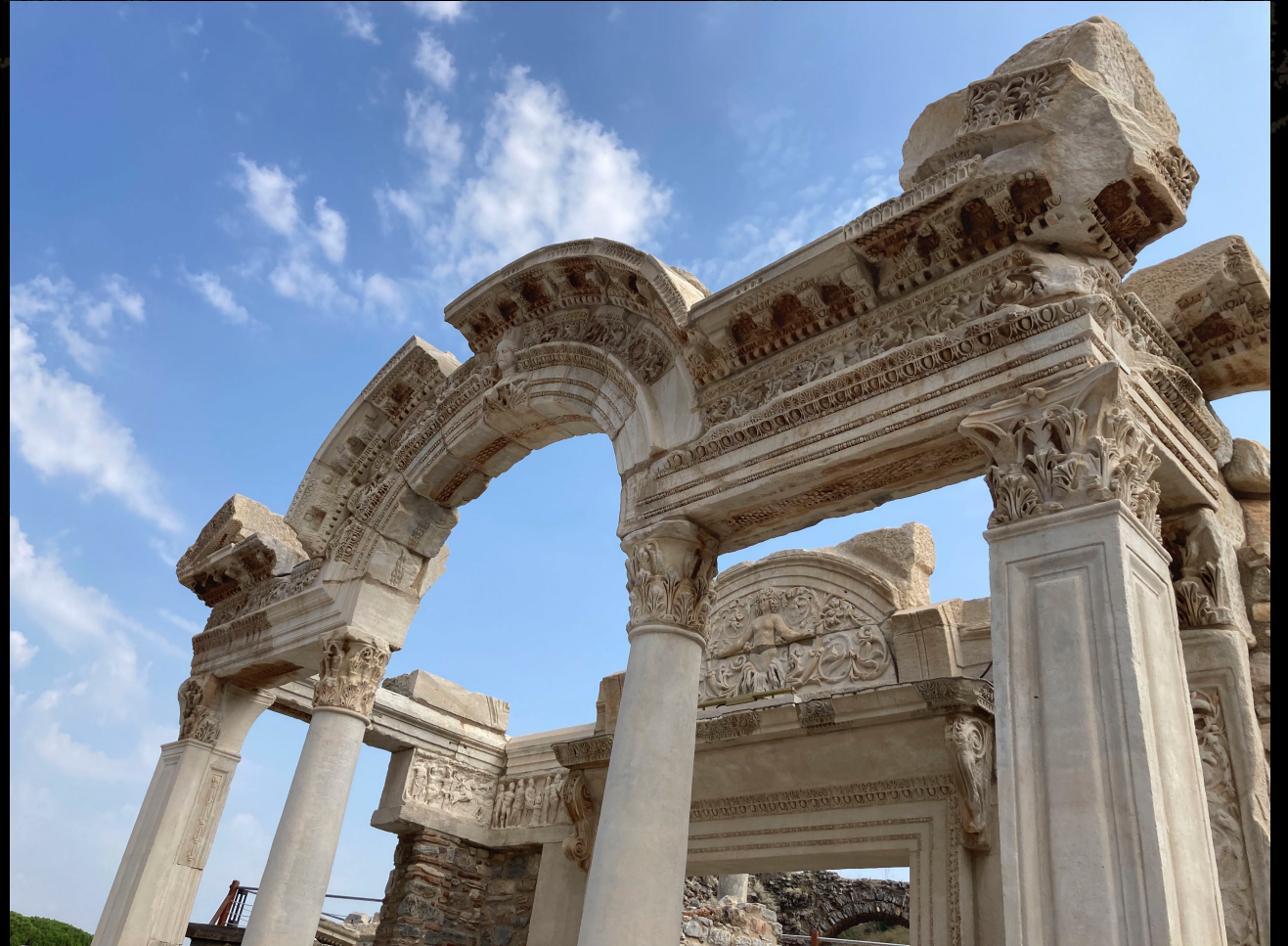
Hedrian; Amazon Queen Ephesia