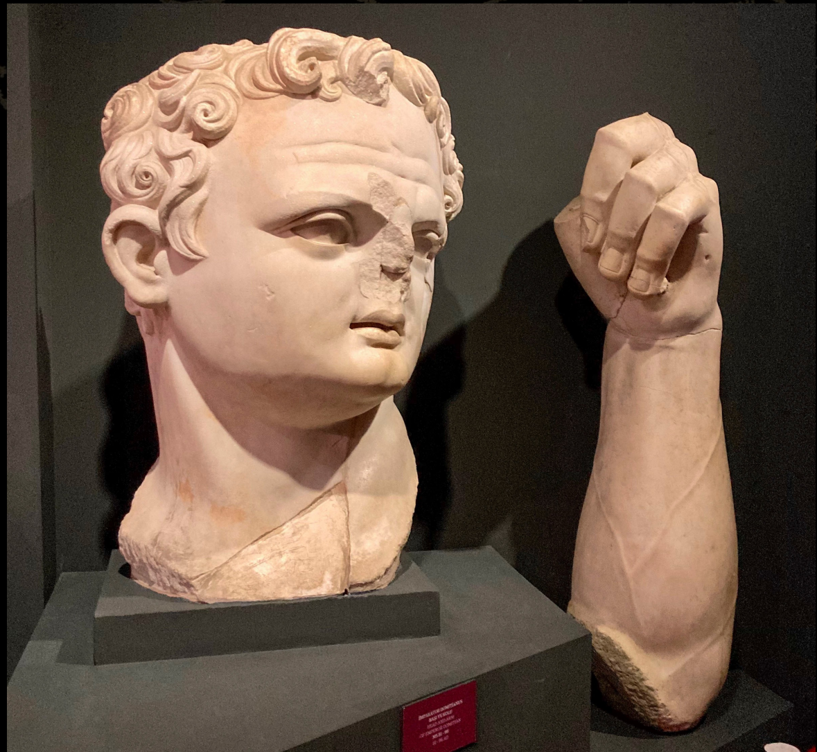
22 ft tall statue of Emperor Domitian