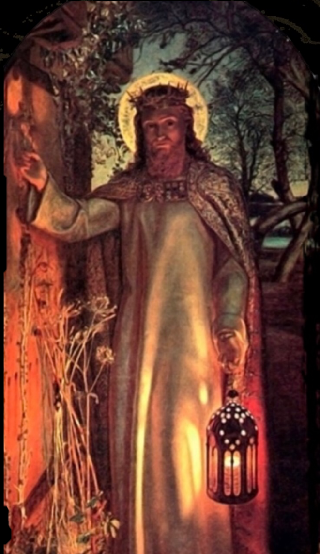
William Holman Hunt's "Behold, I stand at the door and knock"

20 Behold, I stand at the door and knock. If anyone hears my voice and opens the door, I will come in to him and eat with him, and he with me.